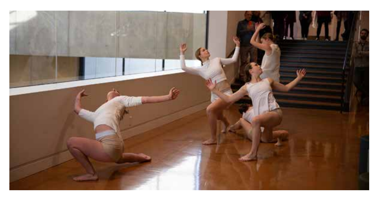
Ascension, a contemporary dance performance by choreographer Elizabeth Shea, was created in celebration of the museum's reopening.